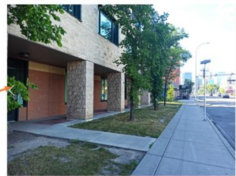
West side entrance

Please note that during these three days, visitor health screening questionnaire will be done in the Board Room adjacent to the side entrance on entering. We apologize that rapid test will be not offered during this time. It would be of great help if families do your own rapid test at home prior to the visit if necessary.