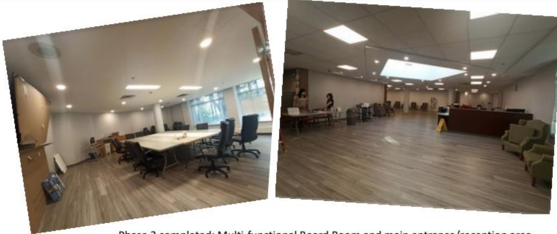
Phase 2 completed: Multi-functional Board Room and main entrance/reception area

Phase 3 of the renovation project is in progress and scheduled for completion by mid November. After completion we will have 2 more conference rooms and a brand new administrative office.