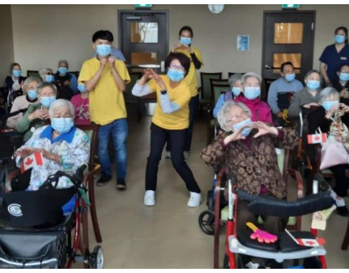
Dancing with residents in Wing Kei Greenview

Fairchild Radio also generously provided snacks, sponsored by Lotus Deli, in appreciation of the staffs' hard work and dedication to all the residents.