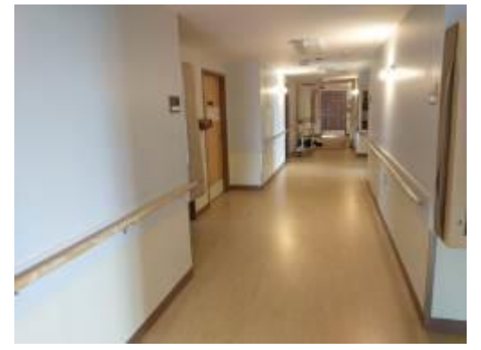
Fourth Floor Refreshed Walls