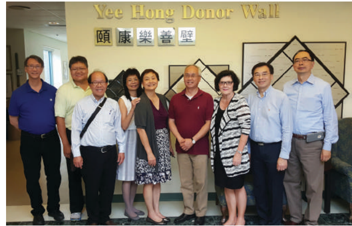
Top left: 1st visit of Yee Hong, 1998. Top right: Completion of Wing Kei Care Centre (Long Term Care), 2005. Bottom left: Completion of Wing Kei Greenview Phase 1 (Supportive Living), 2014. Bottom right: 2nd visit of Yee Hong, 2016.