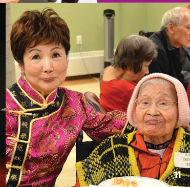
7 Wing Kei Greenview Chinese New Year Banquet for residents February 24, 2018